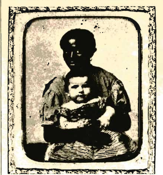
Slave and Friend